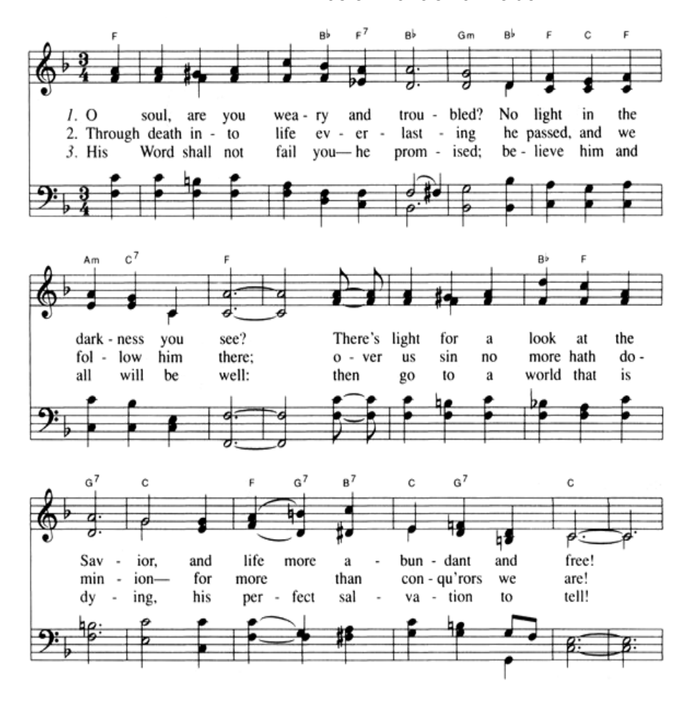
Closing Hymn — Turn Your Eyes Upon Jesus