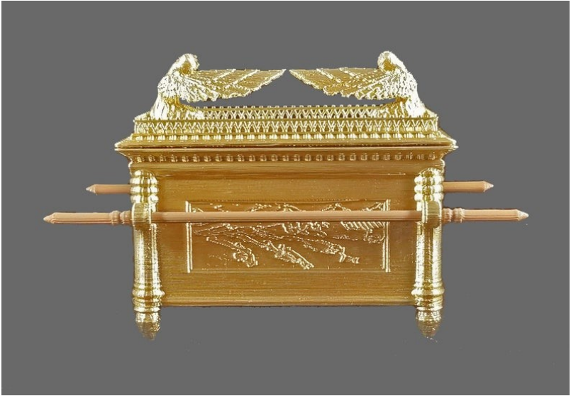
The Tabernacle of Moses