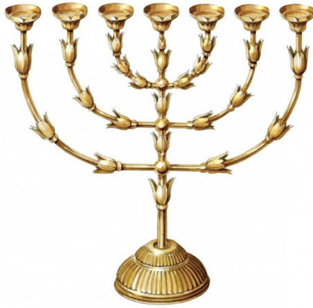
The Tabernacle of Moses